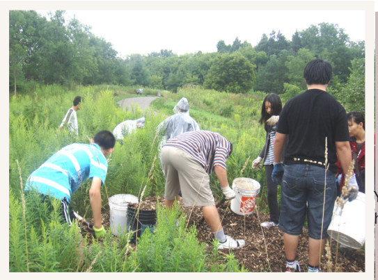
Youth eco-ambassad hard at work!