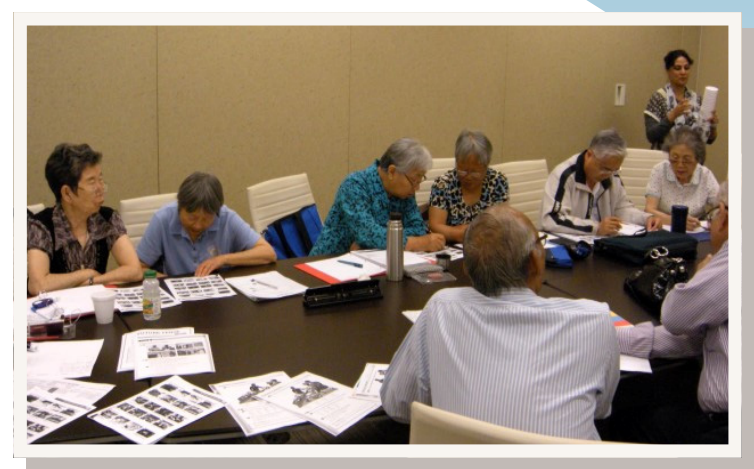
"Building Social Bridges" Workshop