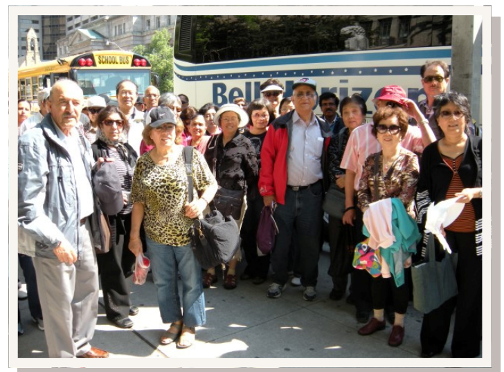
Seniors city tour at the Toronto Courthouse