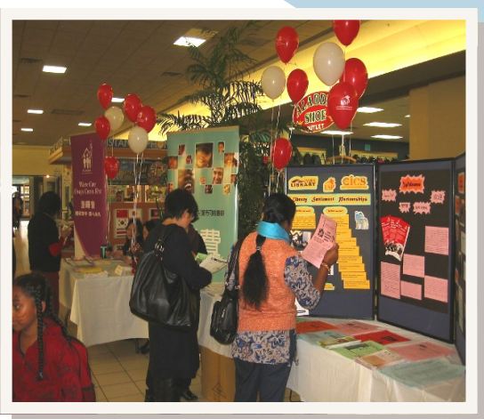
The LSP Day in October providing settlement information in Mandarin, Tamil and Urdu.

Partnerships enabled us to offer a few successful community events in 2012 to broaden our newcomers' reach in the community: A Tuberculosis Awareness session in conjunction with The Scarborough Hospital; a CPR training and awareness event working with The