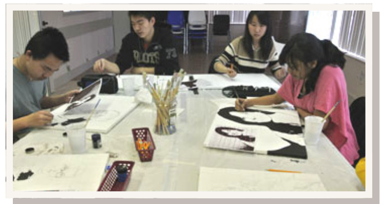
Youth learning the concept of identity through drawing and poetry writing